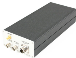
Digital Telemetry Receiver