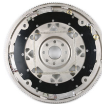
Engine Flexplate Torque Transducer Telemetry Transmitter Assembly