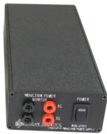
Digital Telemetry Induction Power